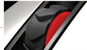
GAMING-GRADE SCROLL WHEEL The ALPS encoder and the rubberized scroll wheel provide an extremely accurate tactile feedback.