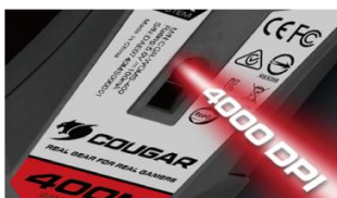
4000 DPI ULTRA-PRECISE OPTICAL GAMING SENSOR The ADNS-3090 High Performance Optical Sensor provides you with pinpoint control.