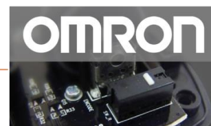
OMRON MICRO SWITCHES 5 million clicks guaranteed.