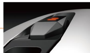
ON-THE-FLY DPI ADJUSTMENT Allows the user to quickly switch between different DPI settings on the go.