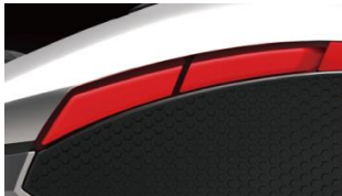
2 x SIDE KEYS