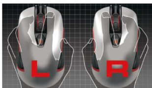
ERGONOMIC AMBIDEXTROUS DESIGN A comfortable design that adapts perfectly to right and left-handed users, blending hand and mouse into a single ultra-precise tool.