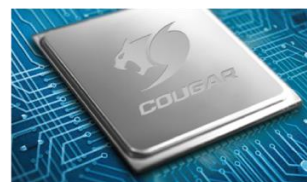
ON-BOARD MEMORY: PERSISTENT PROFILES The on-board memory allows to store up to 3 profiles on the mouse, allowing you to keep your configuration anywhere you go.