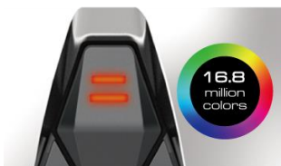
MULTI-COLOR BACKLIGHT SYSTEM Freely choose 1 out of 16.8 million colors to easily identify each profile and personalize the mouse's appearance.